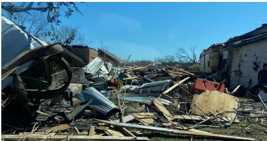
Homes damaged in the wake of the EF-3 tornado that struck Little Rock, AR.