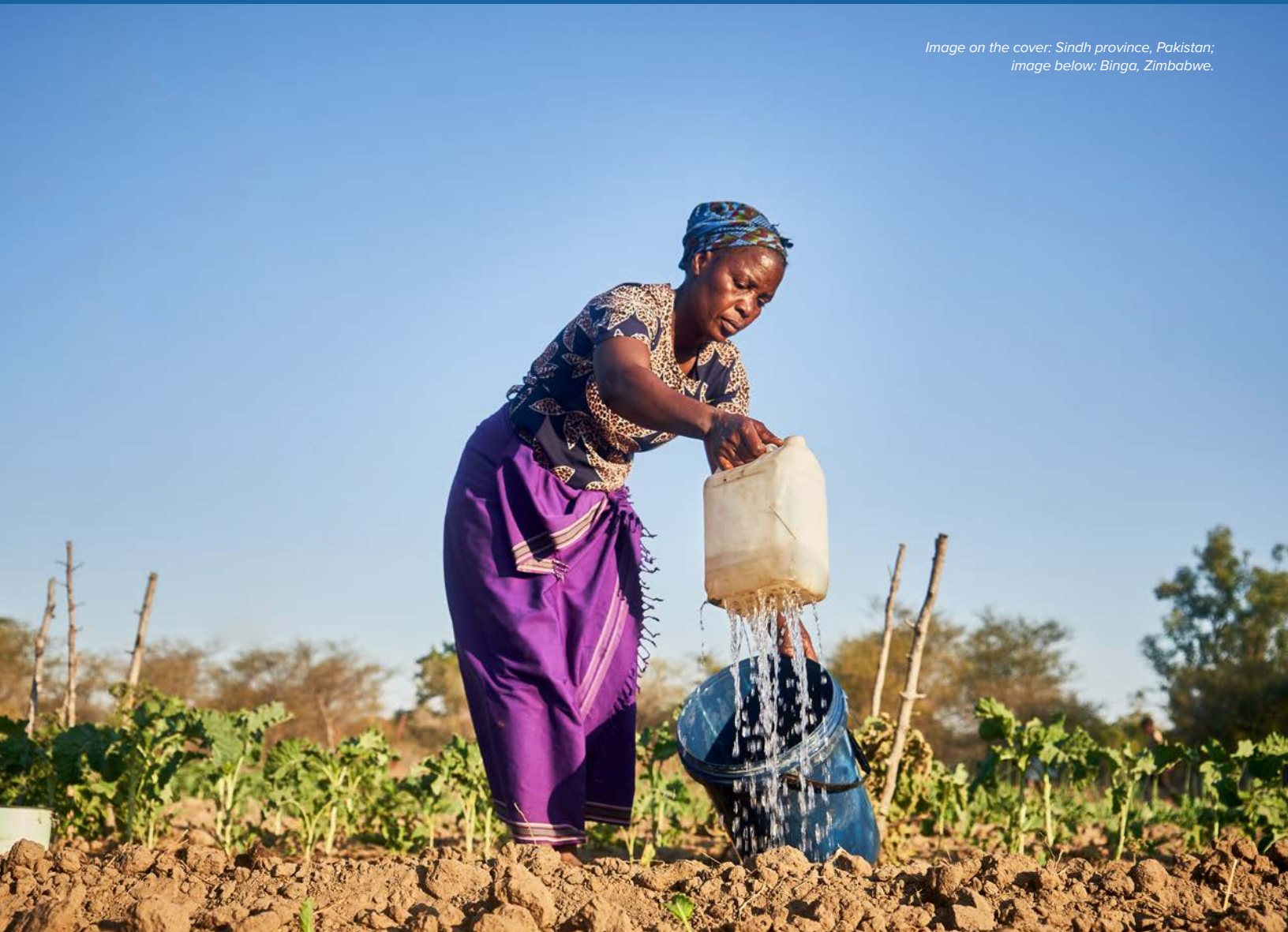
Image on the cover: Sindh province, Pakistan; image below: Binga, Zimbabwe.